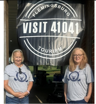
ACE Sponsor Flemingsburg Tourism for Golf Scramble