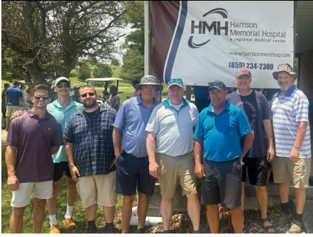
Harrison Memorial Hospital Teams for Golf Scramble & Ace Sponsor