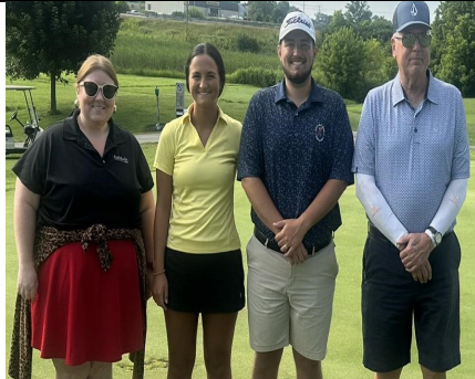
Baldwin CPA's Team for Golf Scramble