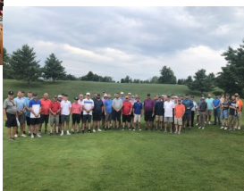
Annual Golf Scramble