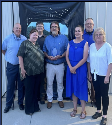
Business of the Year: Hilman Industries