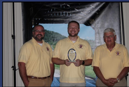
Community Service: Flemingsburg Lions Club