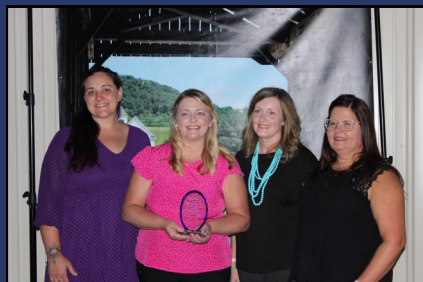
Health and Wellness: Be Still Massage & Wellness