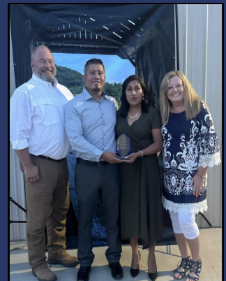
New Business: El Mixteco Mexican Bar & Grill