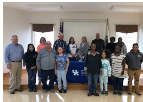
AG Leader of the Year: Fleming County Farmers Market