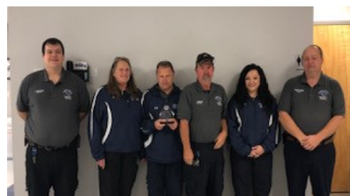
Health and Wellness of the Year: Fleming County EMS