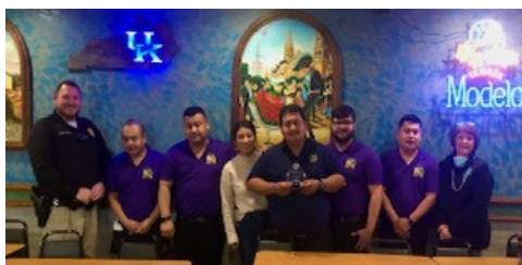
Business/Employer of the Year: El Caminante Mexican Restaurant