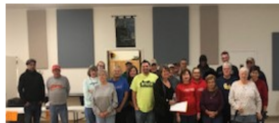
Community Service of the Year: Flemingsburg Baptist Church Food Pantry