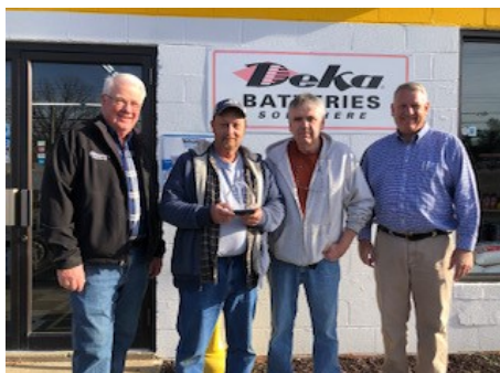
New Business of the Year: A & C Auto Parts